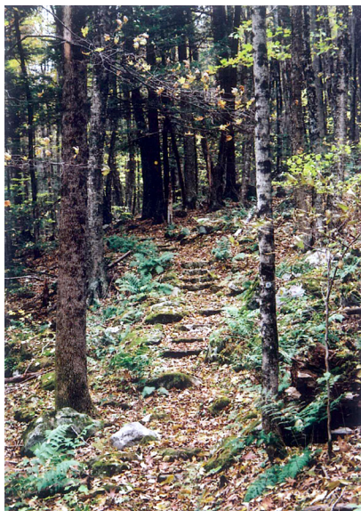
Donato's Trail, East Lee

Keep your eyes open for resident wildlife, interesting boulders with moss, mushrooms & blooming native flowers.