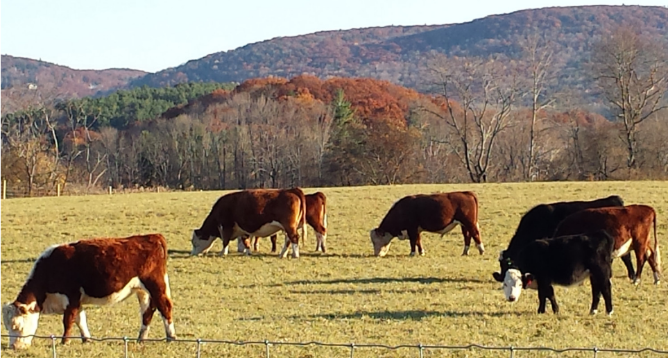
Golden Hill with October Mountain in background