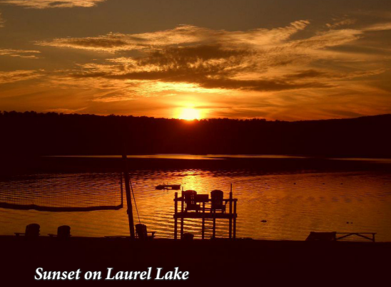
Sunset on Laurel Lake