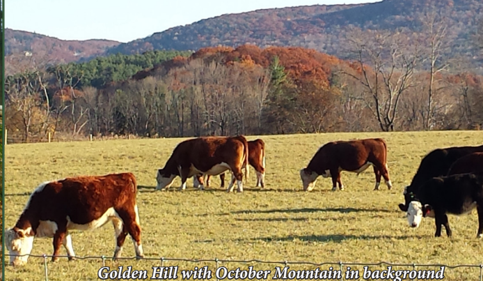
Golden Hill with October Mountain in background