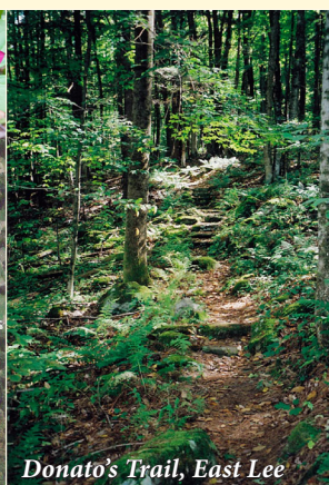
Donato's Trail, East Lee